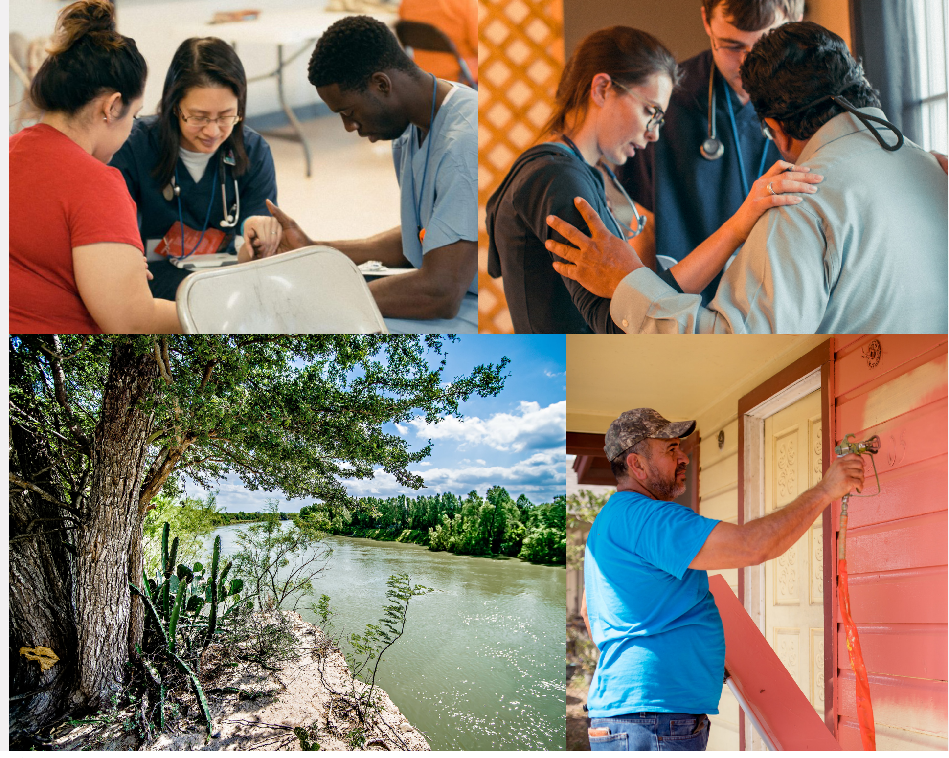
3 | Laredo Ministry Center